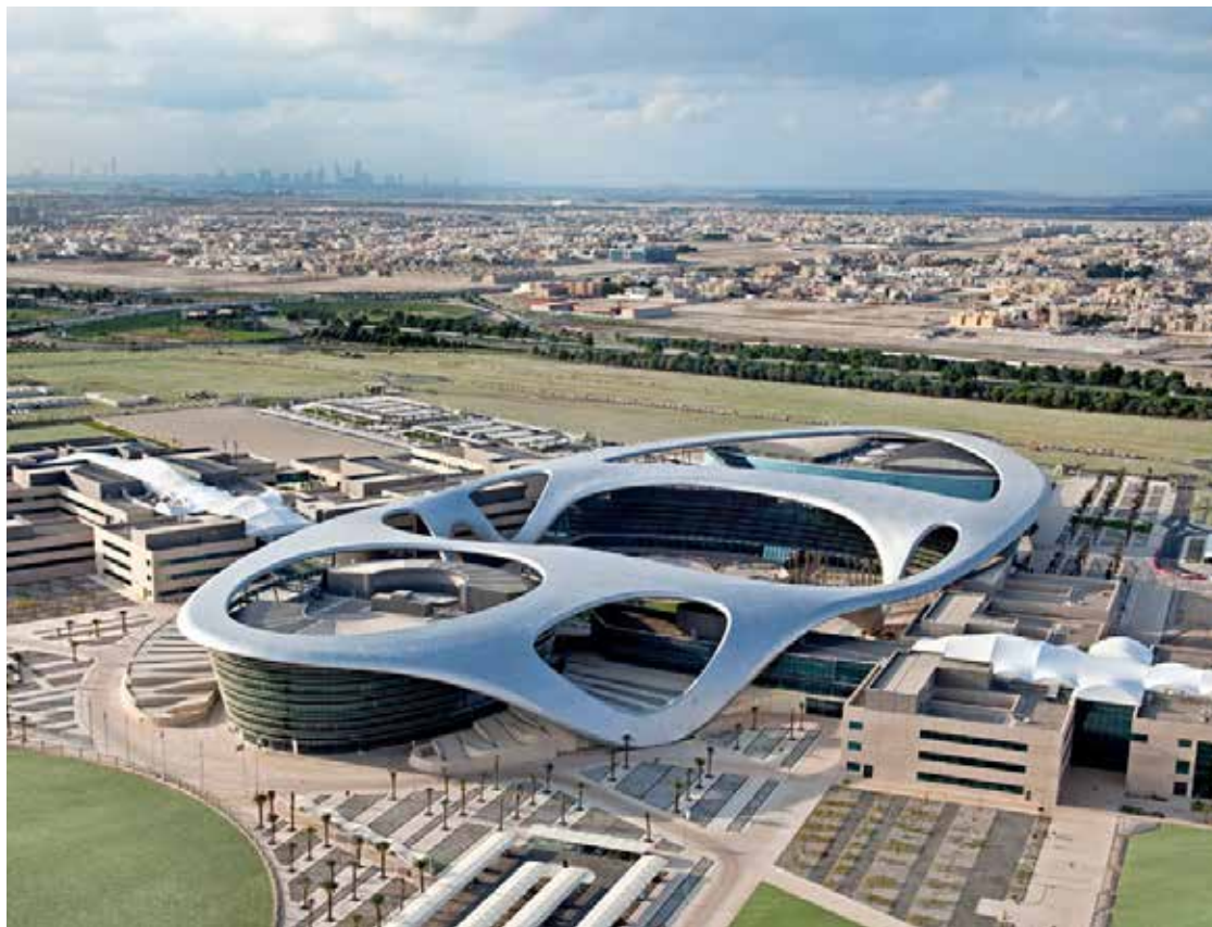
Zayed University, Abu Dhabi

Renowned as being a hub of excellence in education, Zayed University is an enduring tribute to the wise leadership and lasting vision of the founding President of the UAE, the late Sheikh Zayed bin Sultan Al Nahyan whose name Zayed University proudly bears. Zayed University was founded in 1998 with the mission of becoming a high-quality, student-centered, comprehensive university that would educate the UAE's future leaders and actively contribute to the nation's social and economic development. An academic program model built on clear educational outcomes has carried the University through the rapid growth that has occurred since its creation. Zayed University is one university with two campuses, welcoming national and international male and female students in Abu Dhabi and Dubai. Its general education program distinguishes it within