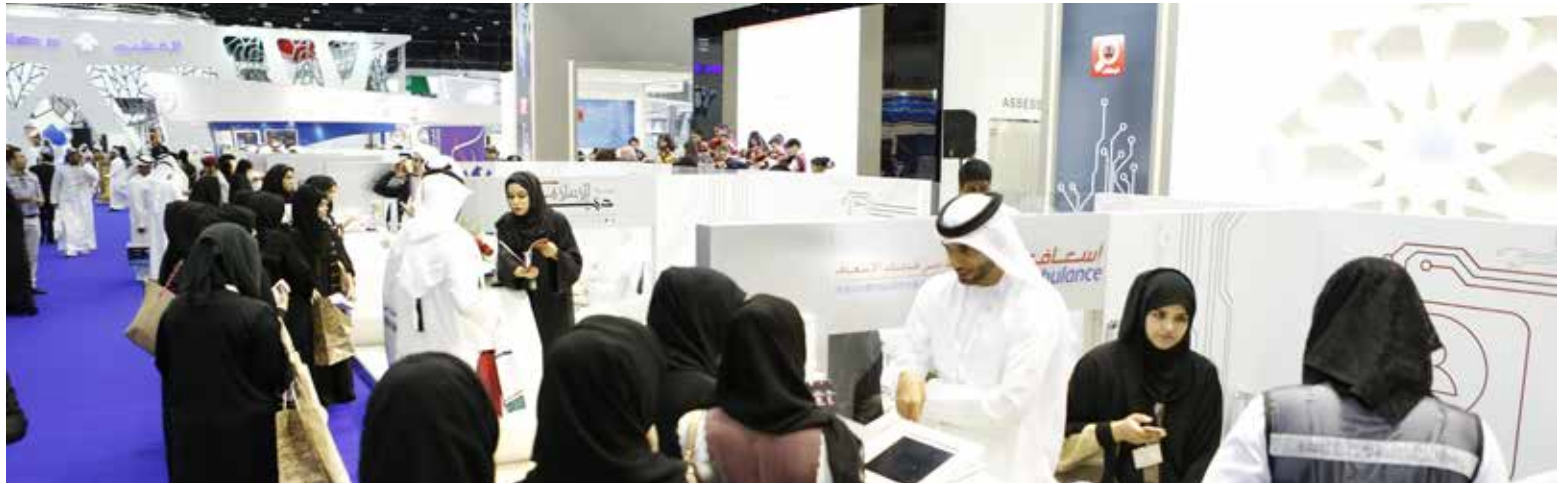
Careers 2017: the best candidates take their future into their hands!

With Young UAE nationals buoyed by new government Emiratisation plans to create jobs in the private sector will be presented with a broad variety of additional career opportunities when employers from a wide range of business sectors assemble in Dubai at the country's leading platform for Emirati job-seekers.